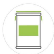
255 Kg DRUM