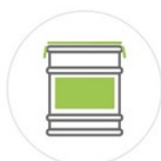
5 Kg DRUM